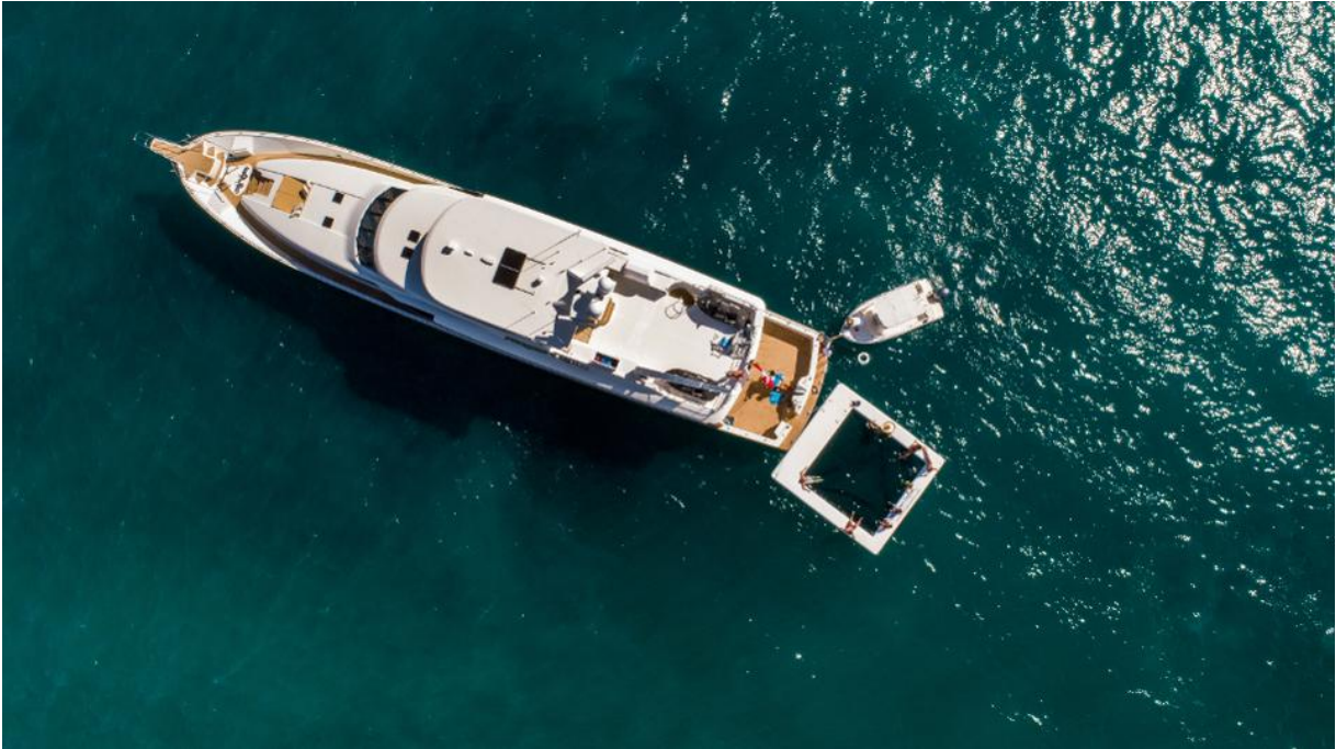
Northern Dream yacht in Los Cabos with water toys NORTHERN DREAM