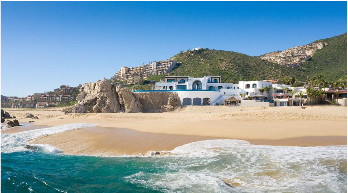
La Datcha Villa in Cabo San Lucas LA DATCHA