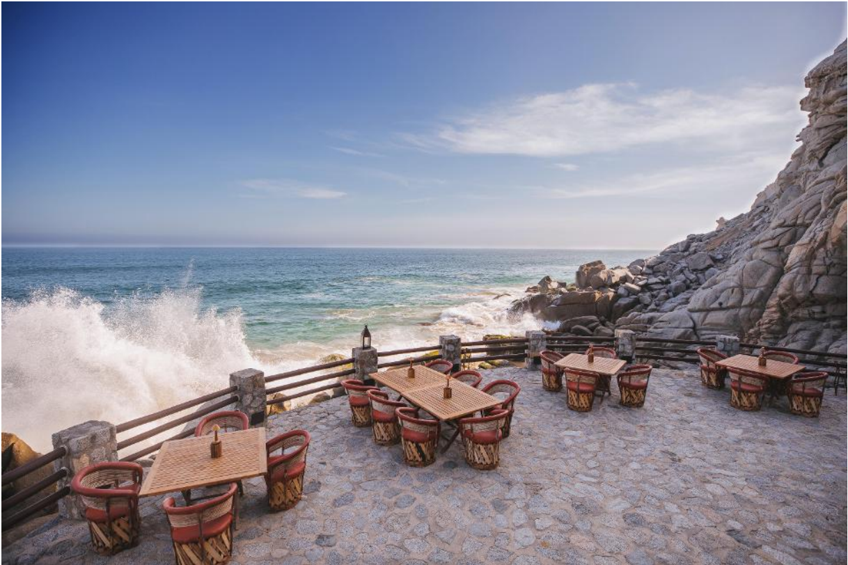
El Farallón restaurant with socially distant outdoor seating at Waldorf Astoria Los Cabos