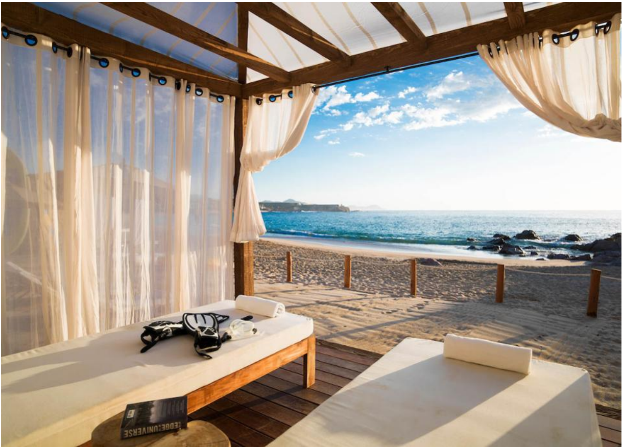
H2O Cave & Outdoor Beach Spa treatments CHILENO BAY RESORT & RESIDENCES, AUBERGE RESORTS COLLECTION

The resort is headed by the wonderful GM Roger Ponce, who has put together an energetic staff dedicated to the customers safety and health concerns. All employees are masked, and every room is completely sanitized before you check in.