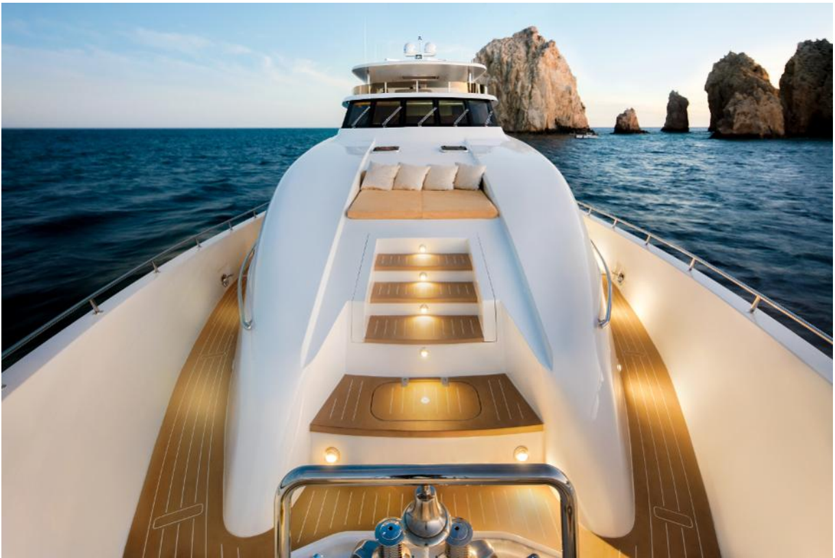
Northern Dream yacht in Los Cabos NORTHERN DREAM

Among the newest charters that I toured is the stunning new 130 foot Northern Dream yacht, owned by Canadian building supply magnate Barry Stewart. With accommodations for eight guests, and an open, modern design, charter guests have plenty of fresh air to enjoy as they spend the day utilizing the ample supply of water toys the yacht has to offer.