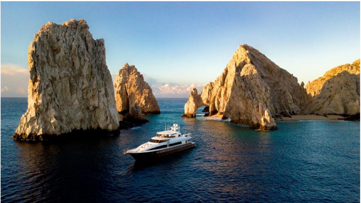
Northern Dream yacht in Cabo San Lucas NORTHERN DREAM

Searching the world for the most amazing People, Places and Things