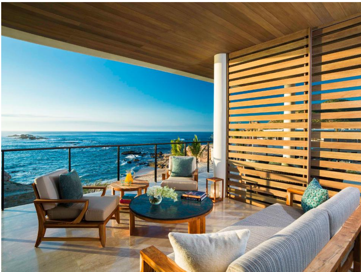
Villa Outdoor Living Room CHILENO BAY RESORT & RESIDENCES, AUBERGE RESORTS COLLECTION

This property is located on one of the few swimmable beaches in Cabo, and the crowd here is more upscale than most. Positioned along a protected, quiet cove, guests can snorkel colorful coral reefs where you may come across celebrities and billionaires who are among the regular visitors and residence owners. During my visit, there were several billionaire homeowners, an Oscar nominee, and a pro athlete practically enjoying the entire resort to themselves.