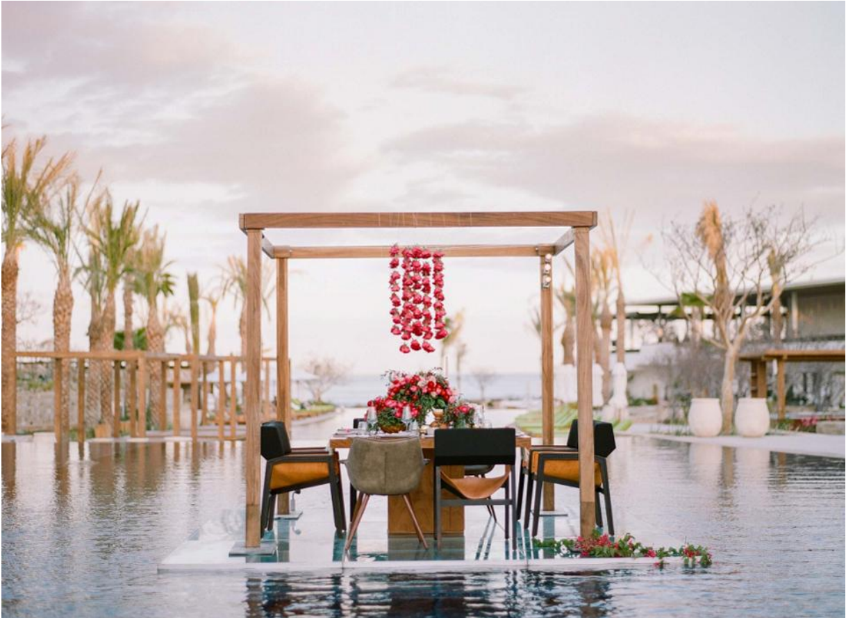
Social distance dining at Chileno Bay Resort & Residences

Guests can select from a wide variety of accommodations, including the dramatic and pricey 24,000 sf Brisa Del Mar Villa, which features six bedrooms that accommodate 12. You can host your entire family in the villa with your own private media room, outdoor terrace with custom bar, and outdoor pool table. The large outdoor pool with private outdoor shower also includes private beach access.